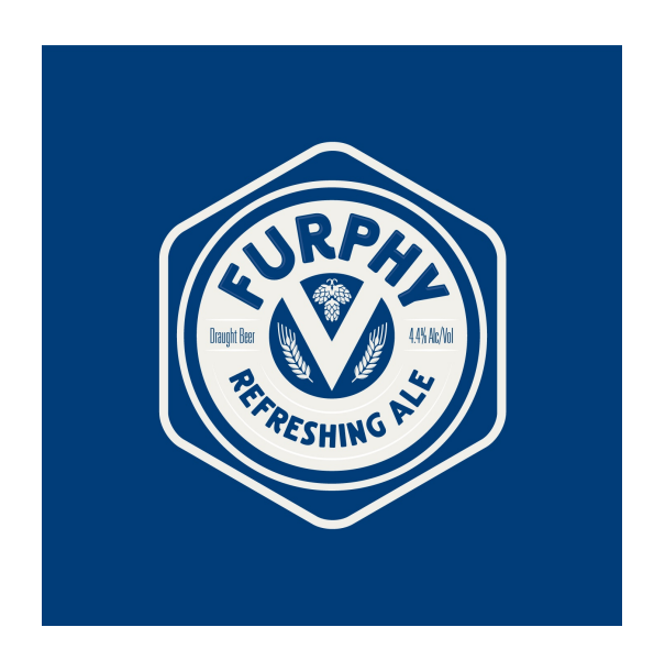
18 March 2020